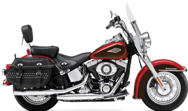
FLSTC HERITAGE SOFTAIL CLASSIC RIDE AWAY FROM* $29,995