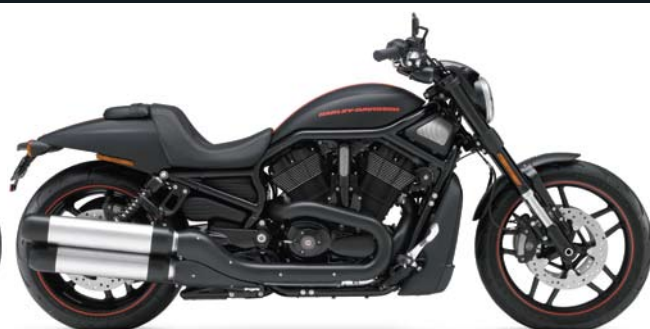
VRSCDX NIGHT ROD SPECIAL RIDE AWAY * $26,495