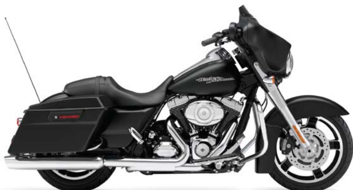
FLHX STREET GLIDE RIDE AWAY* $32,995