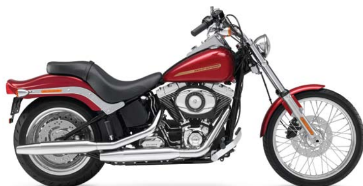
FXST SOFTAIL STANDARD RIDE AWAY* $27,995