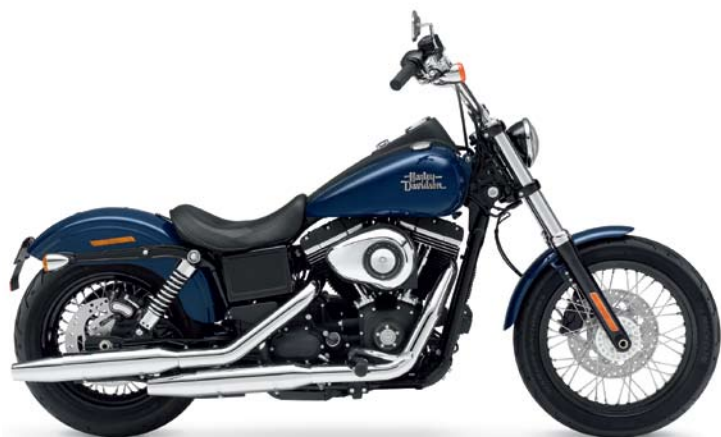
FXDB STREET BOB RIDE AWAY* $21,495

103" Engine Standard on Dyna Switchback, Wideglide and Fat Bob Models. ABS Standard on all Dyna Models.