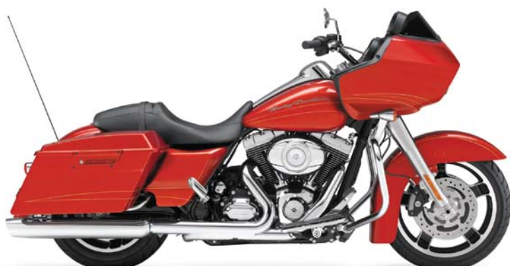
FLTRX ROAD GLIDE CUSTOM RIDE AWAY* $32,595