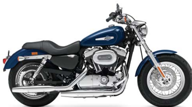
XL1200C 1200 CUSTOM RIDE AWAY FROM* $17,995