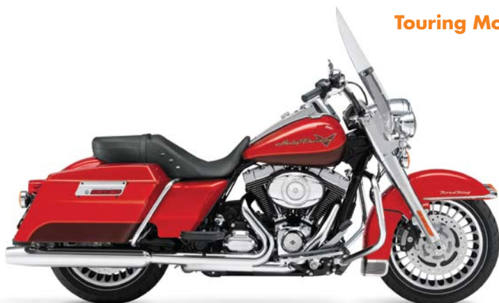
FLHR ROAD KING RIDE AWAY FROM* $31,995

Touring Model Options: Two tone paint where available additional $600.