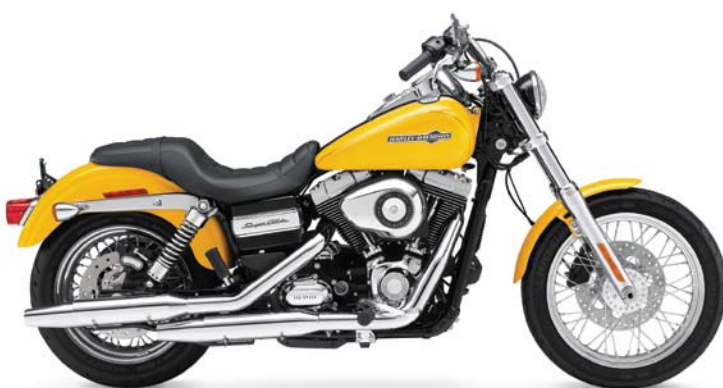
FXDC DYNA SUPER GLIDE CUSTOM RIDE AWAY FROM* $22,495