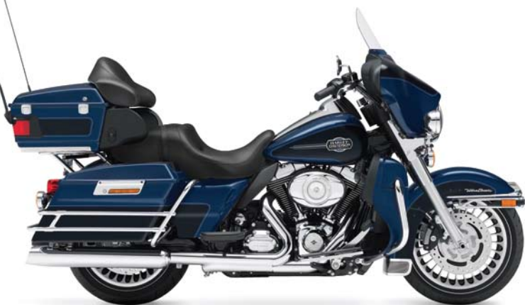
FLHTCU ULTRA CLASSIC ELECTRA GLIDE RIDE AWAY FROM* $36,995