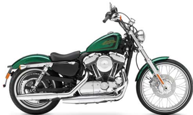
NEW XL1200V SEVENTY-TWO RIDE AWAY FROM* $17,995