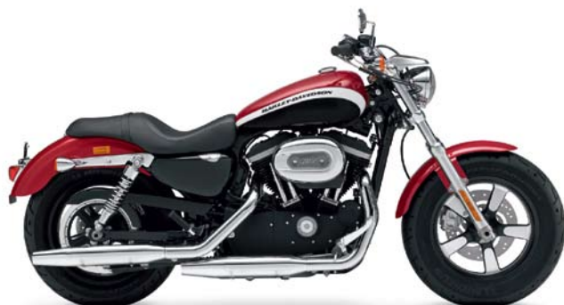
NEW XL1200CA 1200 CUSTOM A RIDE AWAY* $18,495