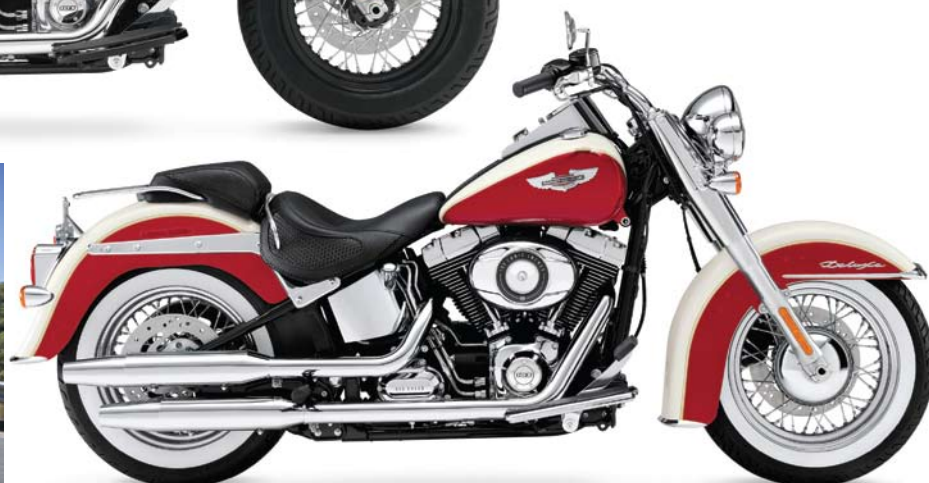
FLSTN SOFTAIL DELUXE RIDE AWAY FROM* $28,995