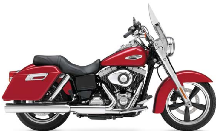
FLD SWITCHBACK RIDE AWAY* $25,995