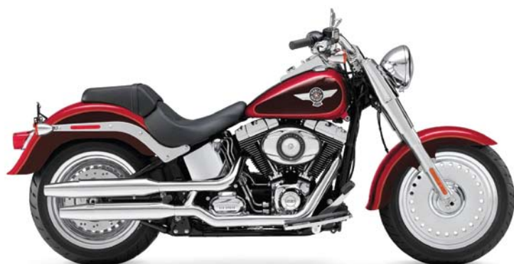
FLSTF FAT BOY RIDE AWAY FROM* $28,750