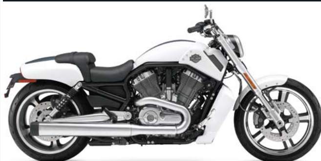
VRSCF V-ROD MUSCLE RIDE AWAY FROM* $25,995

VRSC Options: Two tone paint where available additional $500.