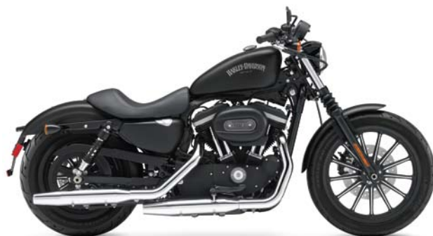
XL883N IRON 883 RIDE AWAY* $14,250