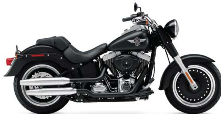
FLSTFB FAT BOY LO RIDE AWAY* $28,495

*RIDE AWAY PRICES INCLUDE ON ROAD COSTS AND 12 MONTHS REGISTRATION, STAMP DUTY AND PRE-DELIVER