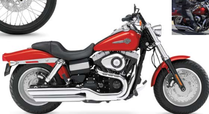
FXDF FAT BOB RIDE AWAY* $24,995