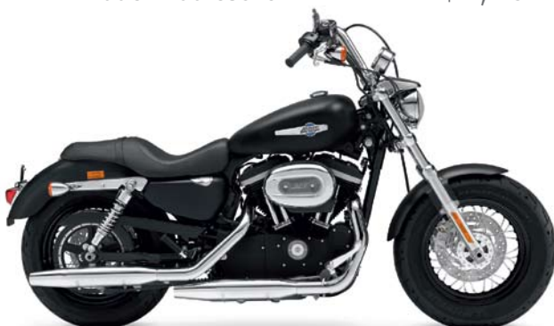
NEW XL1200CB 1200 CUSTOM B RIDE AWAY* $17,995

Sportster Options: Two tone paint where available additional $425. Hard Candy Colour where available additional $500 for XL1200X Forty-Eight models and $1,000 for XL1200V Seventy-Two models.