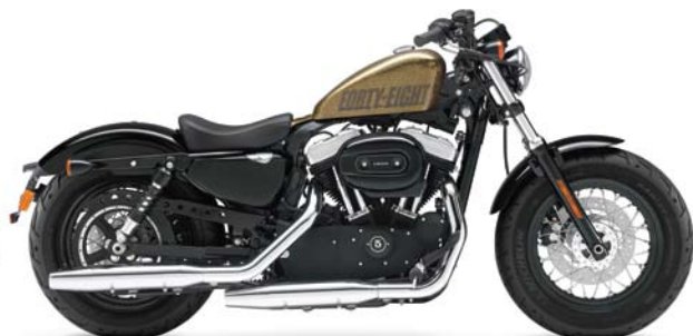
XL1200X FORTY-EIGHT RIDE AWAY FROM* $18,250